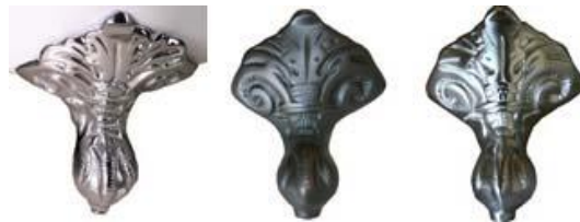
Ball and Claw Feet