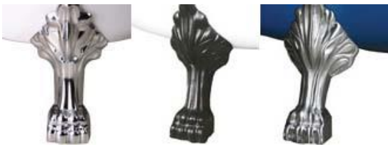
Lion Paw Feet