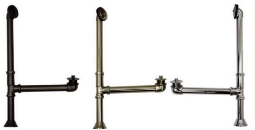
T Type Drains